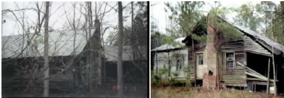
Old Henderson Homeplace in Snoddy Community, Greene County, AL (c1990)